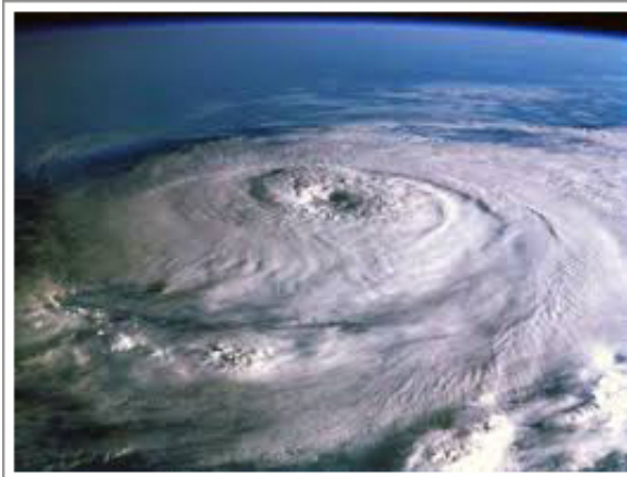
Aerial photo of Hurricane Katrina

Tropical Storm Erika's recent presence was a concern for many of us across the state. While forecasts can change, and there's no way to predict the future, Floridians would be well-served by taking this opportunity to shore up their finances and their disaster plans.