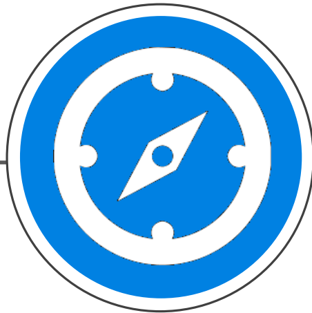
Phase 1 – Discovery