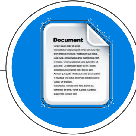
Phase 3 - Document and Publish