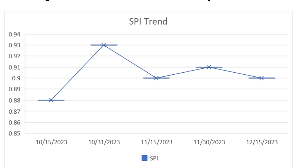
Figure 3: SPI Trend for the Florida PALM Project Schedule

If SPI > 1, the project is ahead of schedule.