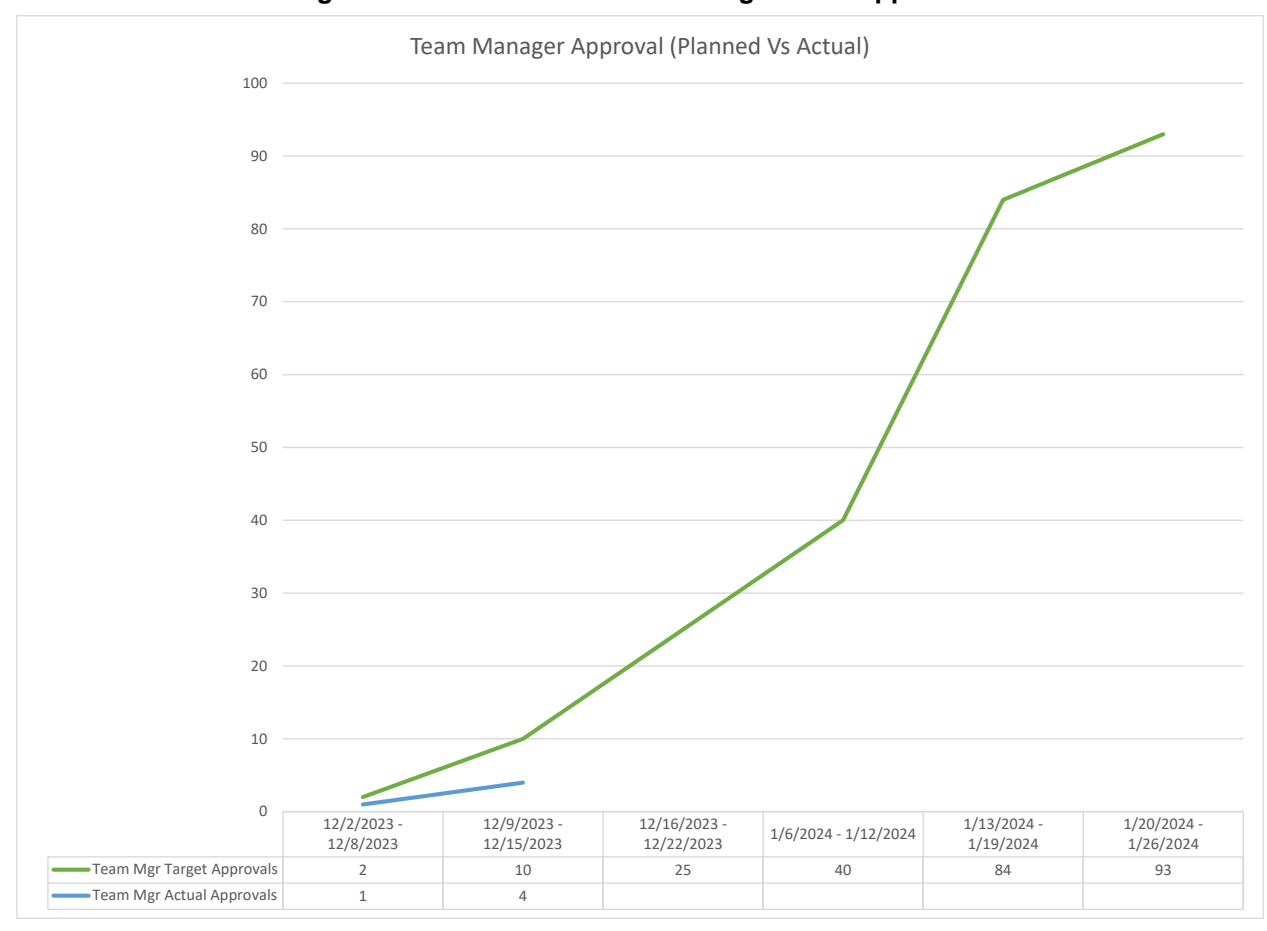
Figure 1: Planned versus Actual Segment III Approvals

The diagram in Figure 1 shows the planned and actual count of Functional Designs (FDs) that have been approved by the Team managers as of 12/15/23. It shows that all the Segment III FD Team manager approvals are slightly behind schedule. It also shows there is a peak in expected approvals in the second week of January. This peak will need to be monitored to ensure approvals do not fall further behind.