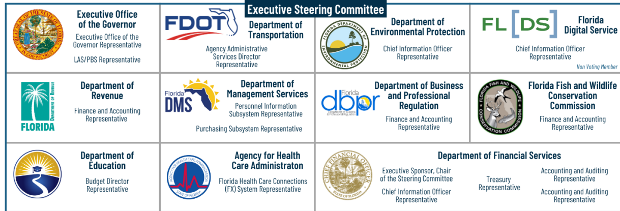
Figure 1: ESC Membership

The following represents the interaction between the ESC, the Project team, and external stakeholders. Business and Project Sponsors attend ESC meetings. An Advisory Council gives feedback and options to the ESC for decision-making. External stakeholders attend ESC meetings during applicable Project activities (i.e., production updates, enterprise activities, requirements/business process updates, testing activities) or upon request.