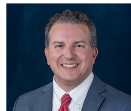
CFO JIMMY PATRONIS

Taxpayer funds were not used to produce or mail these materials.