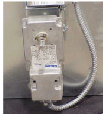
MA-200 series actuator attached on fire and smoke damper. Note: Mounting arrangements vary.